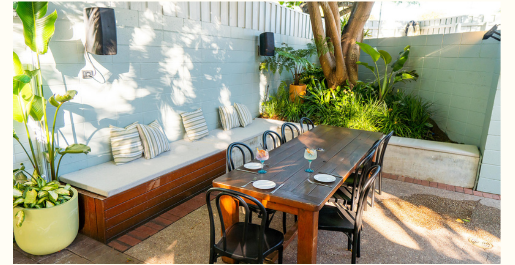
BEER GARDEN RIGHT rear 20-25 guests