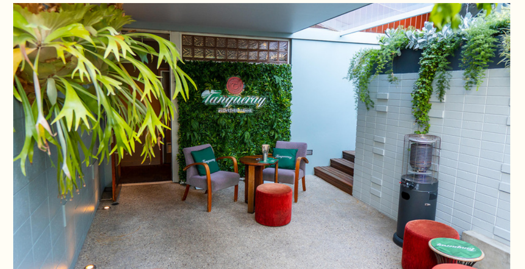
ALCOVE 20-30 guests