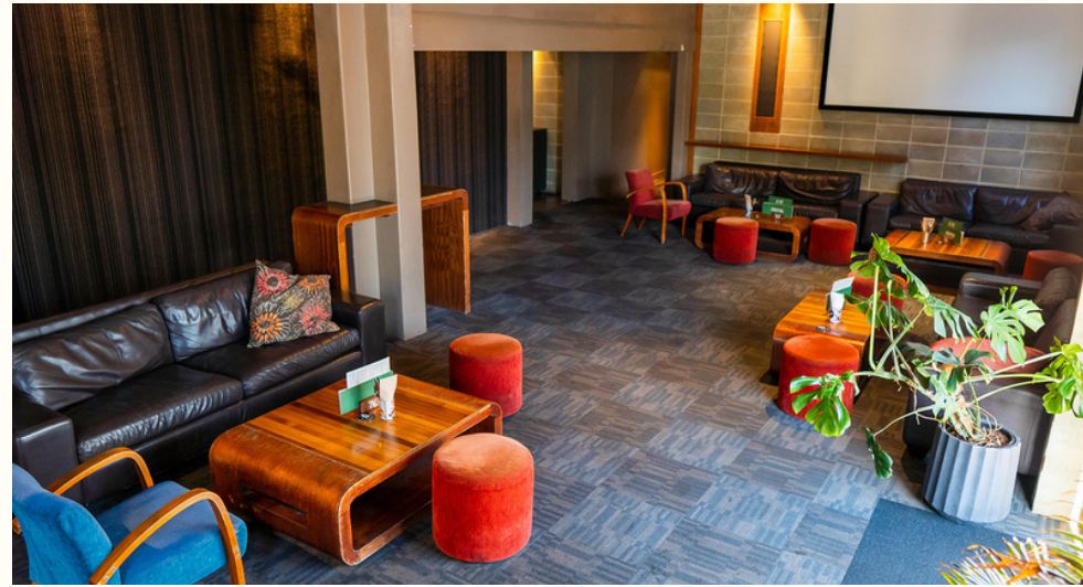
BRISBANE STREET LOUNGE 20-150 guests