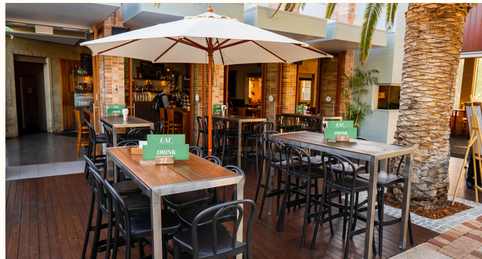
TERRACE tall tables 20-25 guests