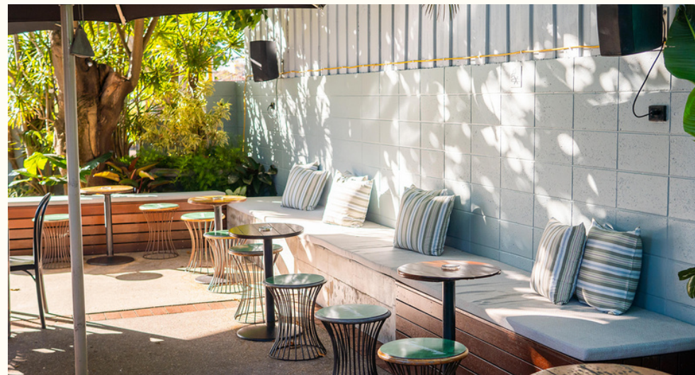
BEER GARDEN LEFT rear 20-50 guests